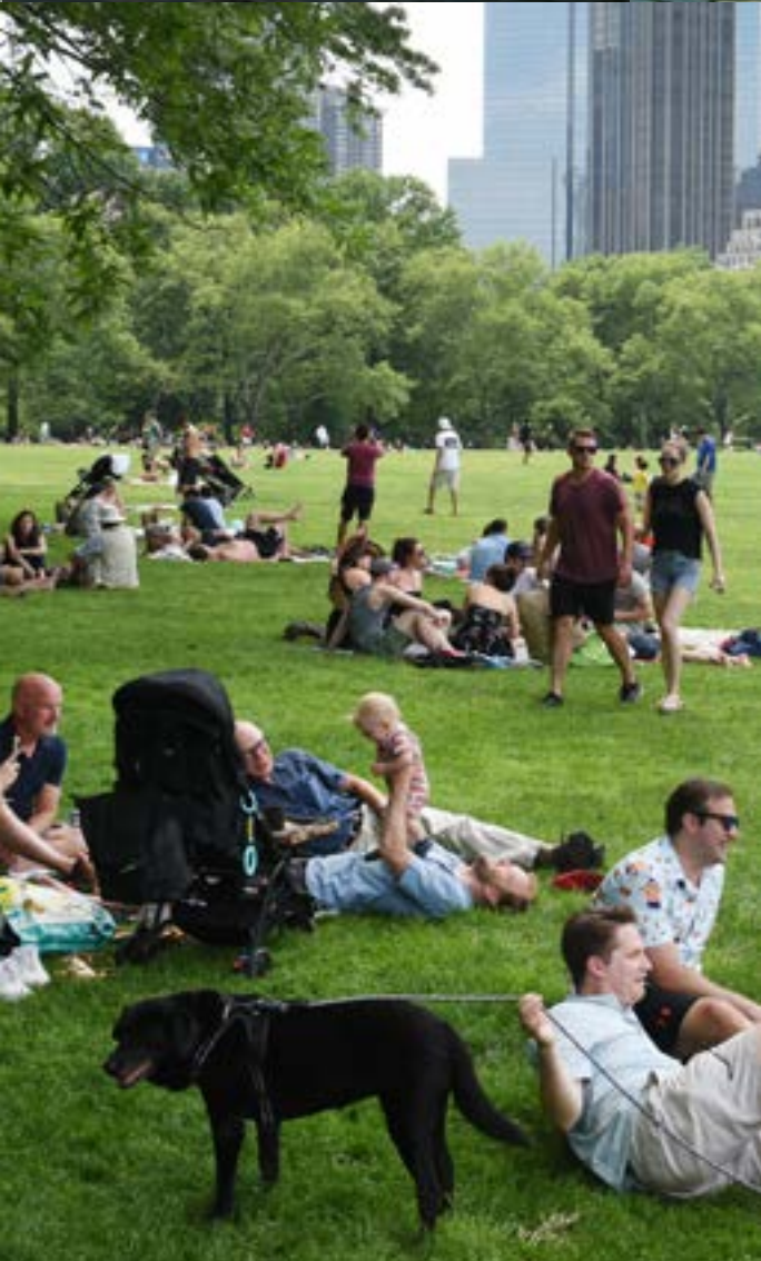
Rikers Island could play host to passive public space

Commemoration: To remember the island’s past, a memorial or museum could be established. This facility should honor those whose lives have been affected by the island and address the harm disproportionately placed on New York’s communities of color. With precedents like South Africa’s Robben Island and the Rikers Public Memory Project, a commemorative site should recognize the complex heritage behind former sites of incarceration and spark a conversation around the meaning of justice and the criminal justice system.