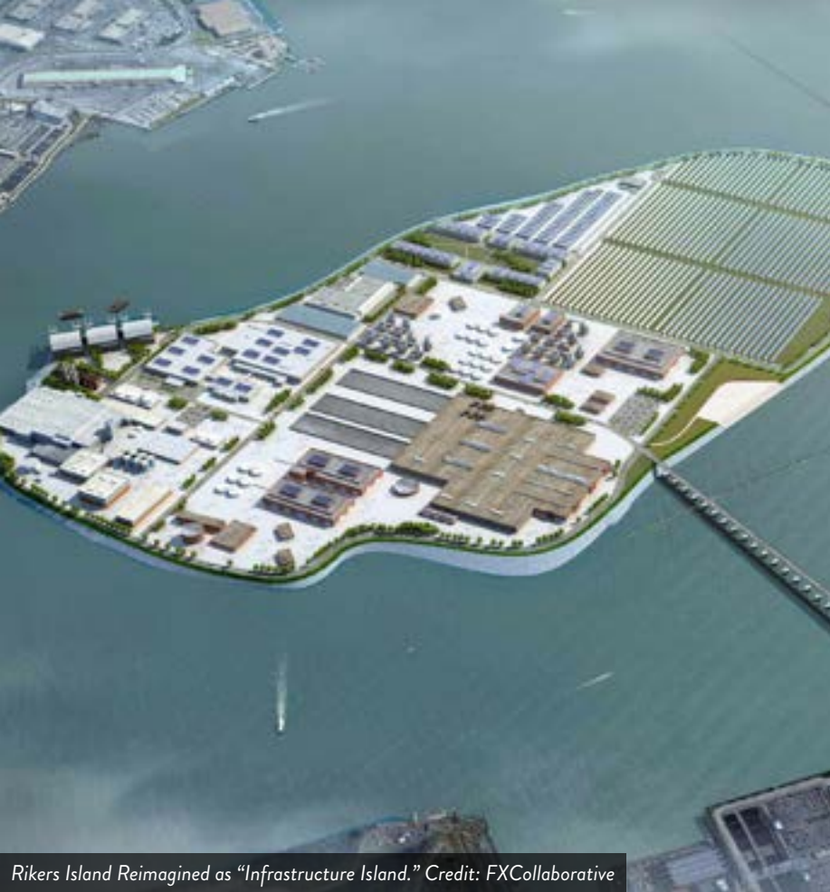
Rikers Island Reimagined as "Infrastructure Island." Credit: FXCollaborative