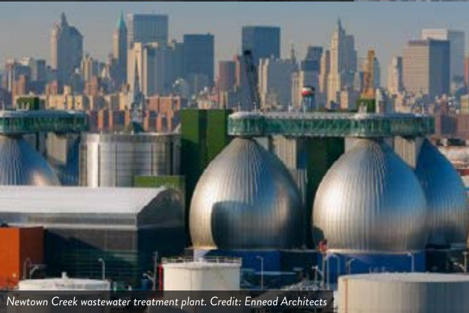
Newtown Creek wastewater treatment plant. Credit: Ennead Architects