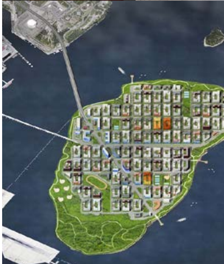
A proposal for Rikers Island city blocks. Credit: Curtis+Ginsberg Architects