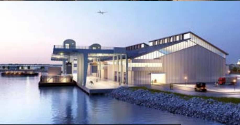
Rikers Island Reimagined as "Infrastructure Island." Credit: FXCollaborative

When planning for the future, the City should consider an array of reuse alternatives to advance equity and sustainability goals: