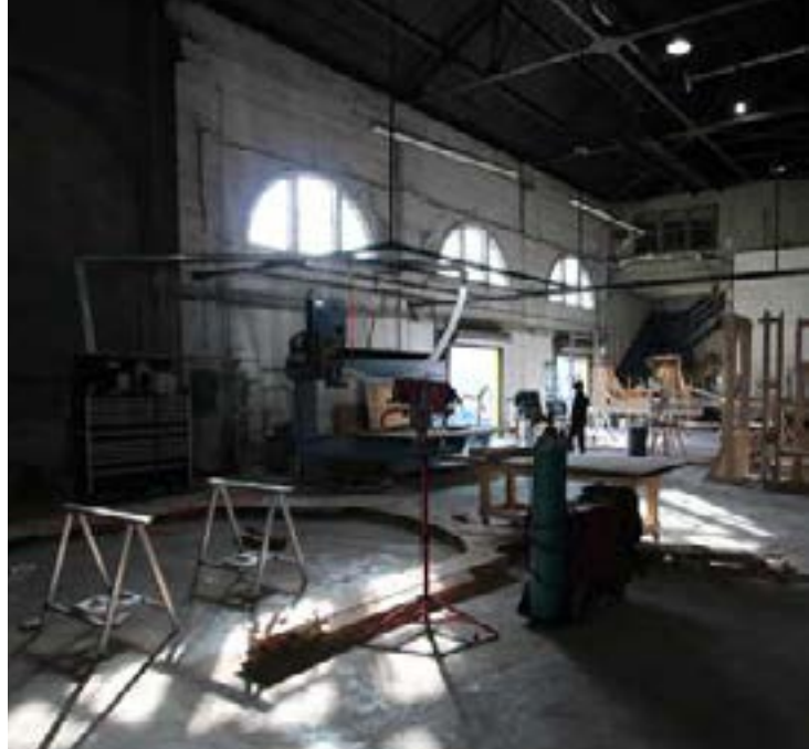
Fabrication studio in the Brooklyn Navy Yard.

Institutional and Commercial: Alongside housing, a mixed-use development could include social infrastructure like K-12 academic, healthcare and cultural institutions and commercial spaces like retail, offices and restaurants. This variety of uses creates jobs and with improved transportation infrastructure, ensures Rikers is a vibrant neighborhood.