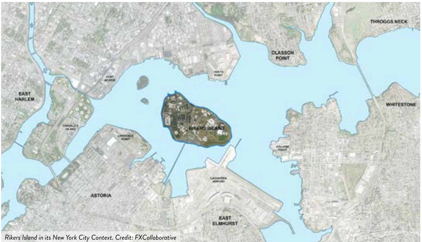
Rikers Island in its New York City Context. Credit: FXCollaborative

However, the island’s historic and current uses mean the site is over 70 percent landfill and is only accessible by the Buono Bridge and a single bus route. This means any redevelopment may involve investment in remediation, foundational engineering and transportation infrastructure. Rikers’ proximity to LaGuardia Airport also imposes maximum height limits of roughly 15 stories and results in elevated noise levels.